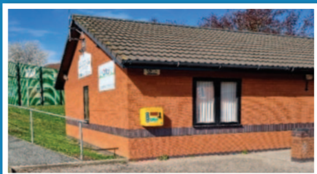
Luke O Connor House Resource Centre, Hightown

Offa Community Council in conjunction with the Welsh Ambulance Service have worked to establish full coverage of Defibrillator units throughout our community. There are five defibrillators funded and maintained by the Community Council.