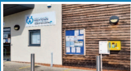
Hightown Community Centre, Wrexham