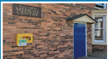
Plas y Bryn Medical Centre, Chapel Street, Wrexham